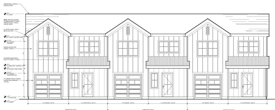
Figure 2: The front of the building