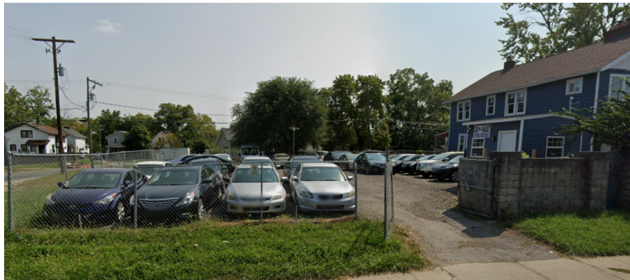
Figure 1: Google Streetview photograph of the property from September 2022. A sign on the side of the shed says “CAR HAASST” with a phone number

Google’s satellite imagery shows this lot as a grass-covered lot. Franklin County Auditor’s 2021 imagery shows a car-covered gravel lot, which is reflected in Google’s September 2022 Streetview imagery. In the southwest corner is a small blue shed with white trim, painted the same color as the adjacent building.