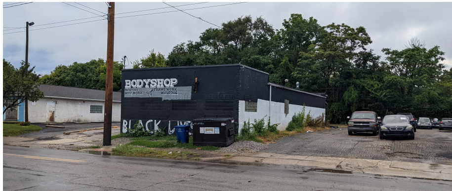
Figure 1: The front and east side of 954 E Hudson St., looking north from the south side of Hudson. Photo by Ben Keith, August 21, 2022.

Zoning committee recommendation: The demolition will probably go through whether or not NLAC writes a letter recommending approval of the demolition permit. The zoning committee expresses curiosity about what the applicant plans to use the lot for after the demolition is complete. We recommend approval.