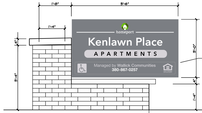
Figure 5: Dimensions of the sign. Image included in application packet.