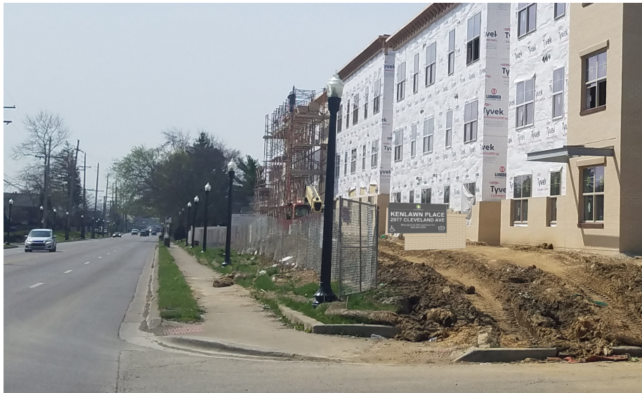
Figure 7: Mockup of sign placement on Cleveland Avenue. They Image included in application packet.