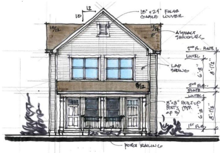
Figure 3: The front elevation of the proposed house at 1371 Aberdeen Ave. Image included in application packet.