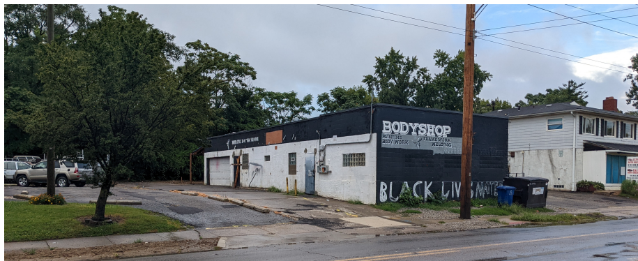
Figure 2: The west and front side of 954 E Hudson St., looking north from the south side of Hudson. Photo by Ben Keith, August 21, 2022.